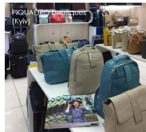
PIQUADRO boutiques (Kyiv)