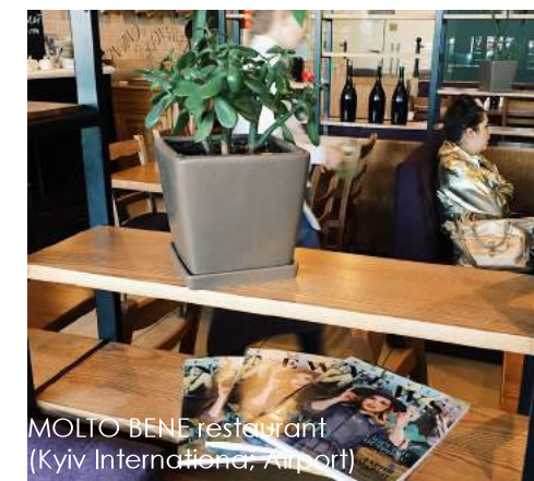
MOLIO BENE restaurant (Kyiv International Airport)