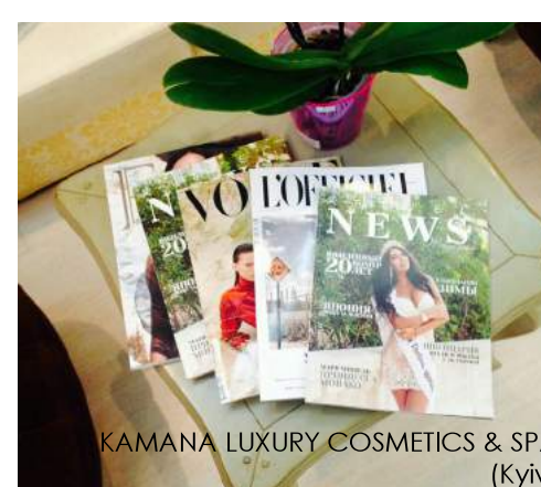
KAMANA LUXURY COSMETICS & SPA (Kyiv)