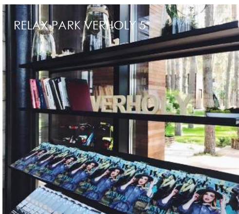
RELAX PARK VERHOLY 5