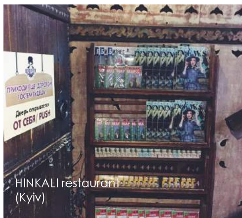
HINKALI restaurant (Kyiv)