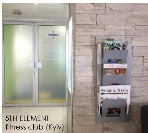
5TH ELEMENT fitness club (Kyiv)