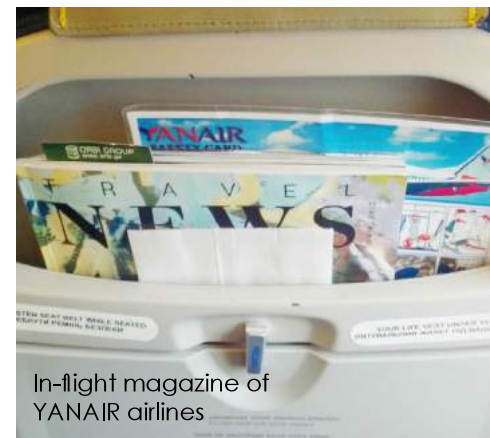
In-flight magazine of YANAIR airlines