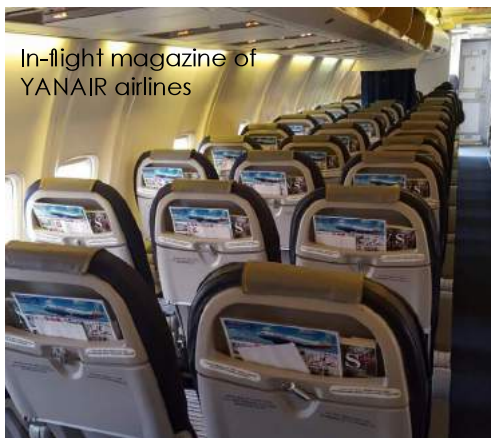
In-flight magazine of YANAIR airlines