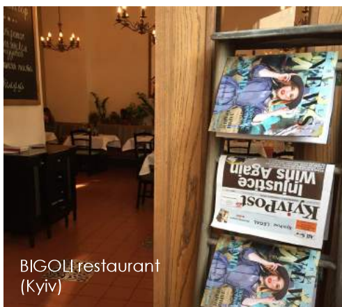
BIGOLI restaurant (Kyiv)