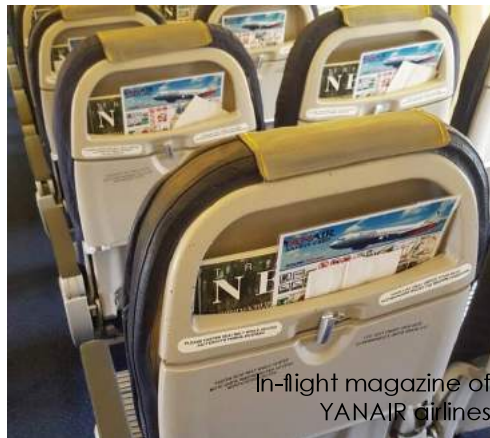
In-flight magazine of YANAIR airlines