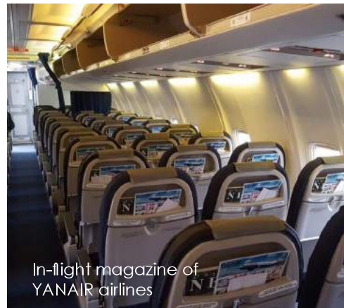
In-flight magazine of YANAIR airlines