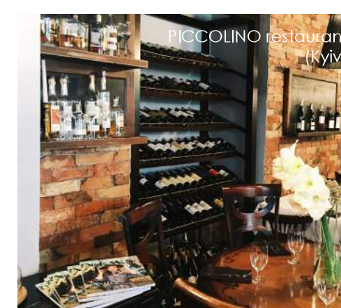
PICCOLINO restaurant (Kyiv)